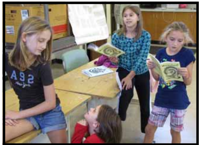
Students in the Musical Theatre Ensemble class rehearse "Wonderland!" which was performed on January 29, 2011

The Theatre department is also offering Drama classes for all ages. The Myths and Magic class allows preschoolers a chance to begin their creative roots and does so with a combination of music, movement and imagination. Beginners Drama is a class for grades K-1 and will be exploring the magical world of Dr. Seuss with a performance based on Oh, The Places You'll Go! The Drama for Young Actors I class for performers in grades 2-4 takes a trip to the wild side with an adaptation of Maurice Sendak's Where the Wild Things Are! Also, join Drama for Young Actors II on the high seas in a rip-roaring adventure as they