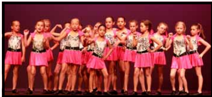
Junior and Senior Concert performances give students a chance to show off what they've learned.

Look for our summer workshop schedules in early March. We offer a very popular pre-school Art and Dance Workshop , as well as an Art, Dance and Theater Production Workshop , which incorporates three disciplines to allow the students to create a final production which will be performed on the last day. We offer a Choreography class for the intermediate and advanced student to be exposed to many different styles of dance and Summerdance , which allows older students to learn choreography, make a costume, learn about stage make-up and put on a performance during the final class. The Martial Arts program will also be continuing throughout the summer for new and current students. For more information about the summer workshops, go to arts.darien.org and click on the summer banner.